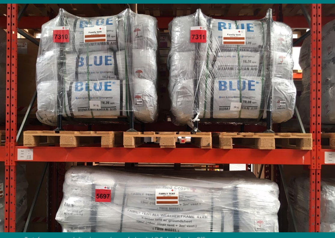
Tents for emergency shelters in a warehouse of a hospital