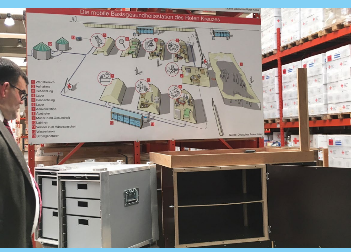
Graphic of a mobile medical center © DRK