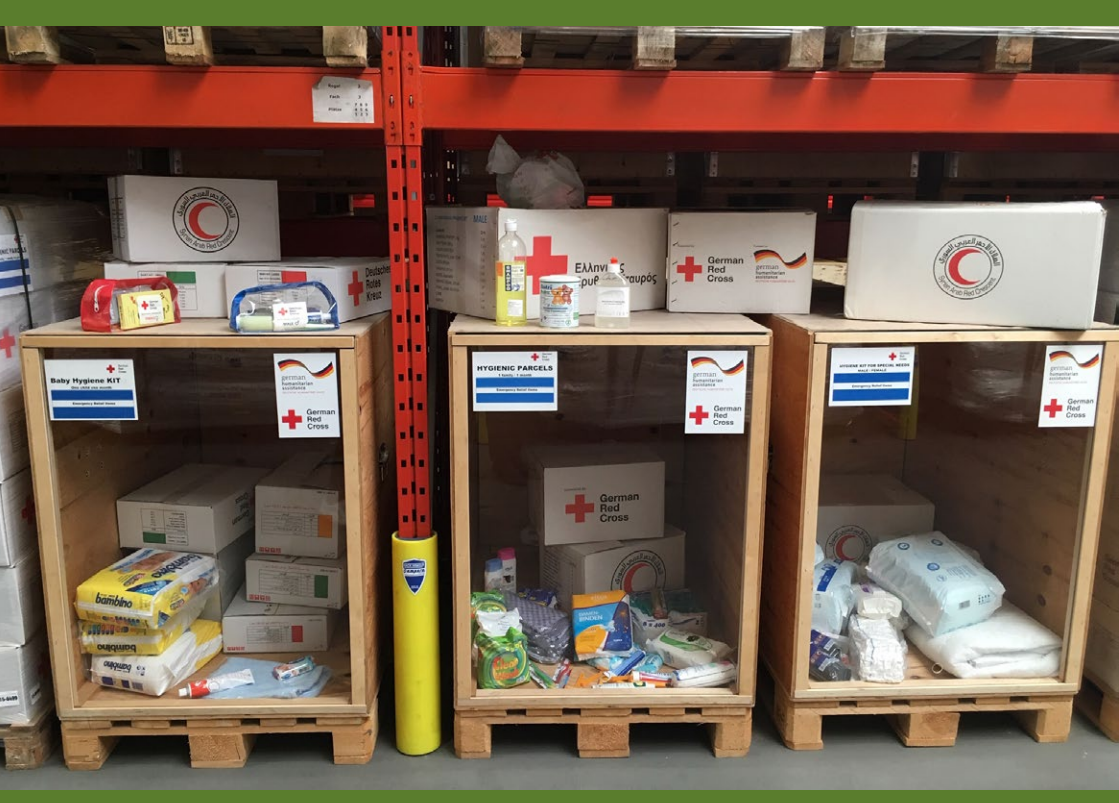
Hyaiene products for emergency relief are being prepared to ship