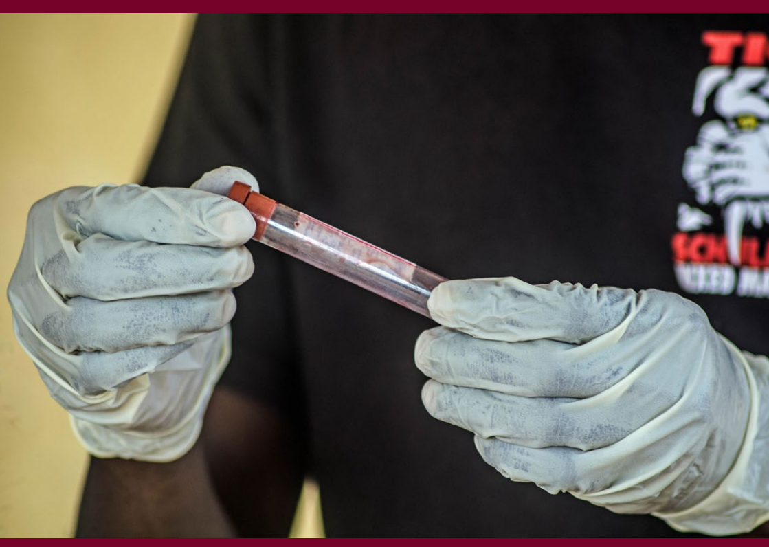
Testing blood for Ebola in Sierra Leone