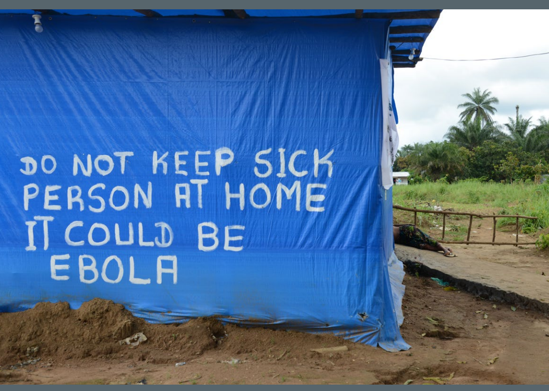
Varnina sian for Ebola in Sierra Leone

5. Joint, coordinated and flexible action