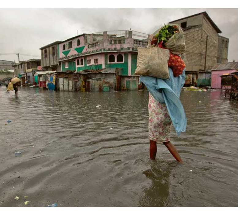
Haiti, consequences of a flood in the Caribbean.

Efforts to promote peace in Somalia can only have a lasting effect if at the same time the impacts of climate change are mitigated. The country is currently experiencing its worst drought in decades; nearly half of the population is suffering from food scarcity. More than 800,000 people have been internally displaced by the extreme drought. The decades-long civil war and violent political conflicts further worsen the situation, and armed terrorist groups such as al-Shabab or armed clan elites are using the vulnerability of millions to rally people to their causes.