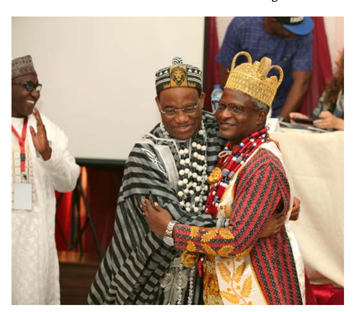
Traditional leaders of the state of Benue after the signing of the peace treaty.

Fighting between these warring communities has flared up time and again since 1997. However, the desire for peace is now gaining the upper hand: thanks to mediation by the Centre for Humanitarian Dialogue and financial support from the Federal Foreign Office, both communities have now declared their willingness to enter into negotiations. In August 2023, they signed a peace agreement regarding the use of natural resources. In both the negotiations and the wording of the agreement, the interests of women, young people and religious and traditional community leaders were taken into account. The jointly developed agreement has the potential to serve as a blueprint for other climate-exacerbated conflicts between neighbouring communities in the same state or all across Nigeria.